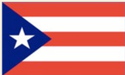
Puerto Rican Flag

Clemente represents more than baseball. That explains why his baseball helmet is at the Smithsonian Museum in Washington D.C., where it will appear with more than 100 objects—along with the Ruby Slippers from The Wizard of Oz , the original Kermit the Frog and a 150-pound piece of Plymouth Rock—in the exhibition “American Stories.”